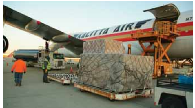
Kalitta Air lands at Rickenbacker International Airport to offload cargo and take advantage of the low cost business model and impressive customer service.