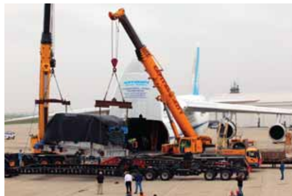
An Antonov 124 was loaded with time-sensitive cargo at Rickenbacker International Airport earlier this year. With uncongested cargo ramps, 12,000 foot long runways and reasonable fuel prices, the airport was the best decision to help move the large cargo through the supply chain efficiently and effectively.

Make changes now that can be a part of your successful long-term strategy. Be bold in this volatile market and land your cargo at LCK – the smarter, faster and better gateway. Your clients will thank you.