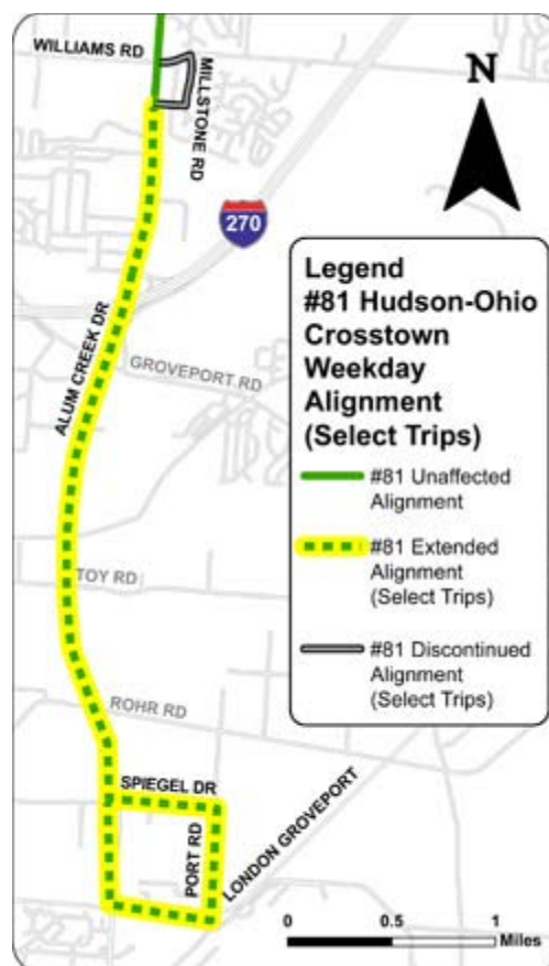
COTA's extended #81 bus route to the Rickenbacker area.

More information on bus routes and times can be found at www.cota.com .